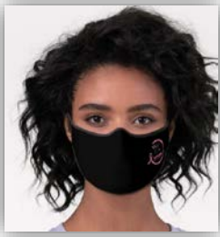
Premium Face Mask